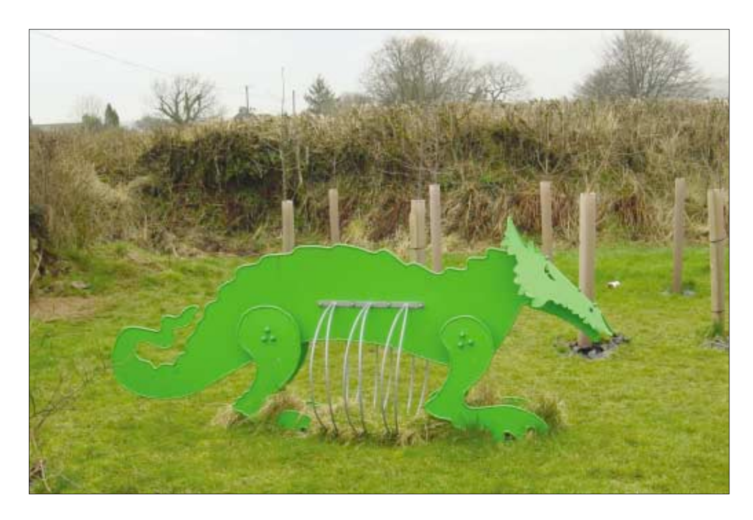
This play area in Devon incorporates reference to local myths

and maintenance after the NOF money runs out. Sources of such funds include central and local government, charities and voluntary bodies.