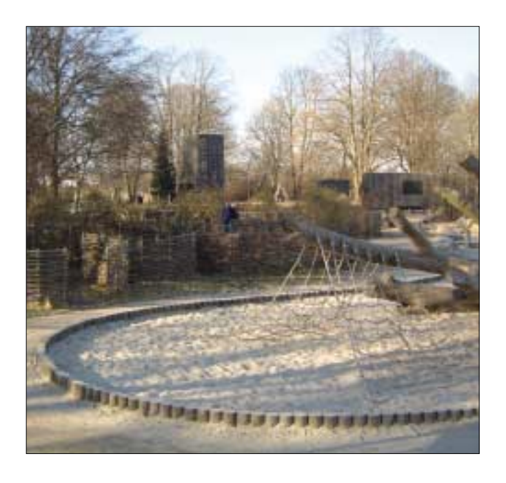
Natural features are a common component of play spaces in Copenhagen

good evidence that children and young people value and enjoy landscaping, sand, water, trees and bushes and other natural elements as much as, or more than, equipment.